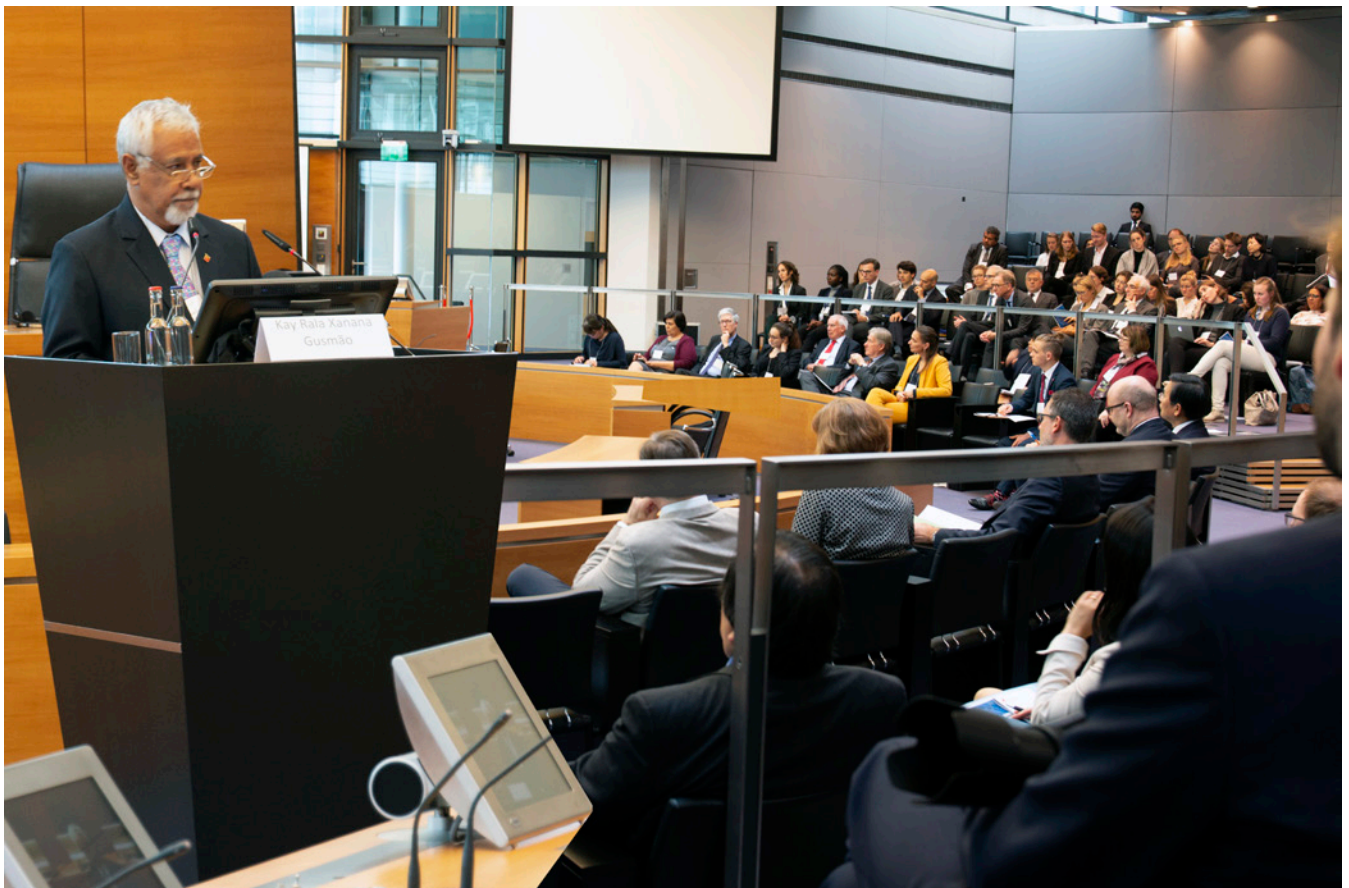
Chief Negotiator at ITLOS, Hamburg, 17 October 2019

Timor-Leste's second summit is planned for 8 – 9 October 2020 in Dili. https://www.timorleste-summit.com/