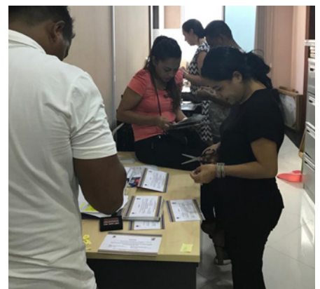
Getting ready with the invitations to be distributed locally, MBO, August 2019