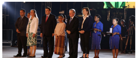
Order of Timor recipients