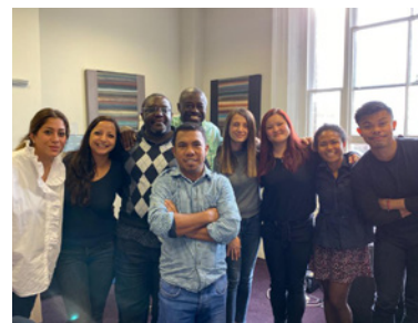
Intensive Communications and Public Relations, ISOC, London, 4-15 November 2019