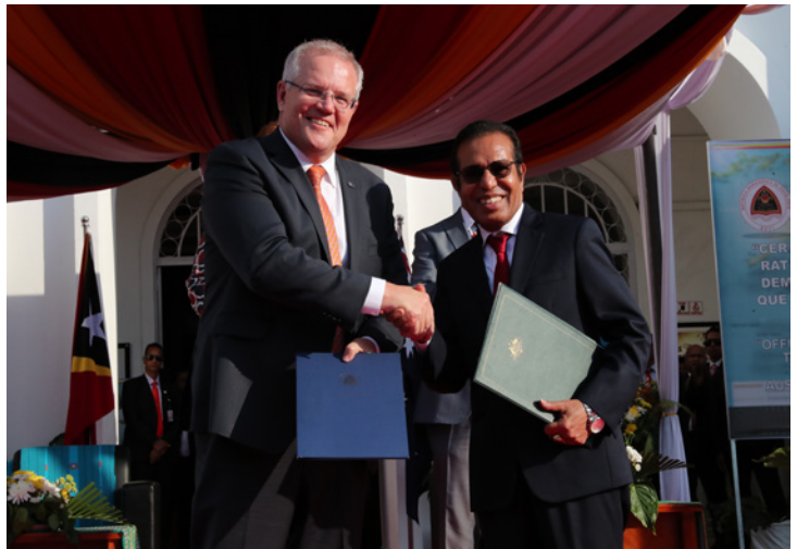
Prime Minister Scott Morrison and Prime Minister Taur Matan Ruak exchange the diplomatic notes, Palacio do Governo, Dili, 30 August 2019

The full text of the Treaty can be found here: http://www.gfm.tl/wp-content/uploads/2018/03/Eng-Timor-Sea-Maritime-Boundary-Treaty_English.pdf