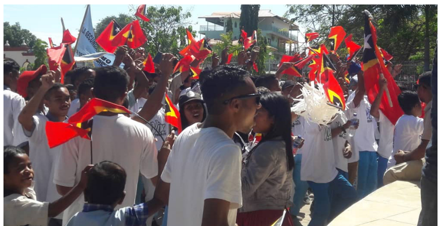
Peace March, Dili, 4 September 2019