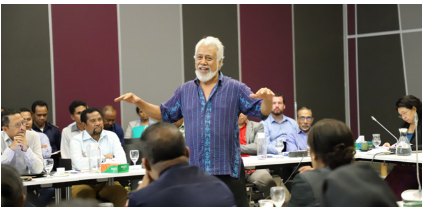
President of the OC at one of the many meetings before the celebrations, Ministry of Finance, July 2019

The celebrations took place from July 1 to August 30 in all the municipalities of Timor-Leste. The OC promoted a set of traditional dance and music contests to preserve Timor-Leste's national culture and history and ensure both are passed on to future generations. The official celebrations took place on August 30 in Tasi Tolu.