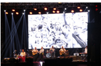
Dili Allstars sings 'Maubere Timor' with photos depicting Timor-Leste