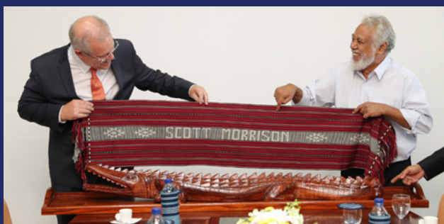
Australian PM and Chief Negotiator meet in Dili, MBO, 30 August 2019

H.E. Xanana Gusmão was also featured on ABC (Australian Broadcasting Corporation) news, as well as Sir Peter Cosgrove and H.E. Dr José Ramos-Horta, on a documentary special, 'A Call to Arms: The Liberation of East Timor'. Please visit https://www.youtube.com/watch?v=FhN7zIIXgk4