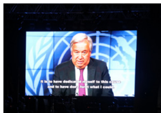
UN Sec-Gen delivers a video message: "Timor-Leste has inspired the world."