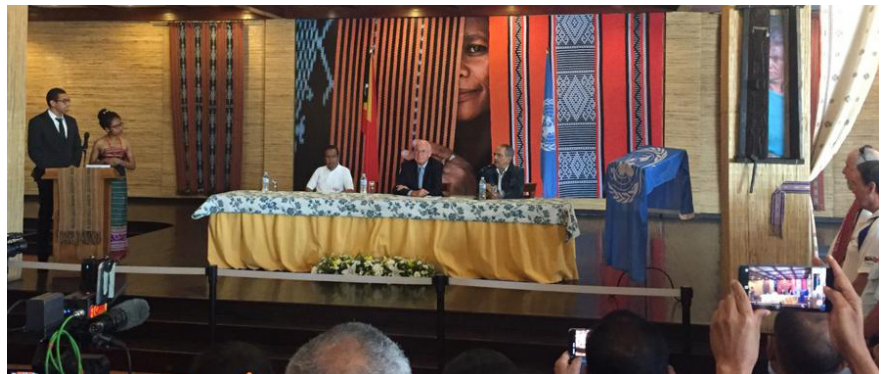
Re-enactment ceremony, Hotel Timor, Dili, 4 September 2019

This event was followed by the March of Peace to the Dili Convention Centre, in which hundreds of people participated, including members of the Government and National Parliament, guests, young people, students and others.