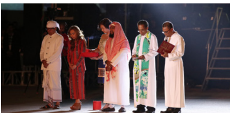
Ecumenical prayer from the religious leaders in Timor-Leste