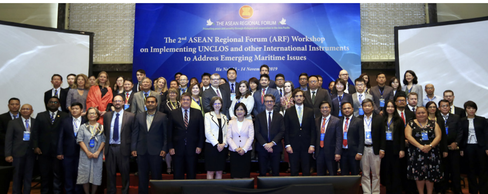
ARF participants, Hanoi, Vietnam, 14 November 2019

The Maritime Boundary Office was invited to attend this workshop together with the Timor-Leste Ministry of Foreign Affairs and Cooperation in Hanoi, Vietnam. The forum focused on the existing maritime disputes in the region. It also looked into measures to efficiently implement UNCLOS and other international instruments to tackle these existing maritime challenges, including sovereign disputes, delimitation of maritime boundaries, and various transboundary issues such as sea law enforcement, maritime pollution, climate change, as well as terrorism and piracy.