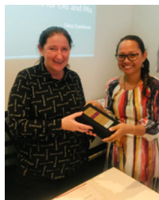
Essential Skills for Executive Assistant, New Horizons, Brisbane, 4-7 November 2019