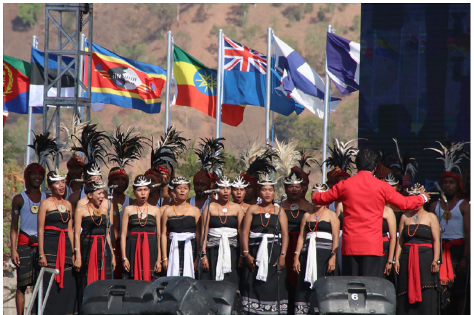
Pre-event concert, Tasi Tolu, 30 August 2019