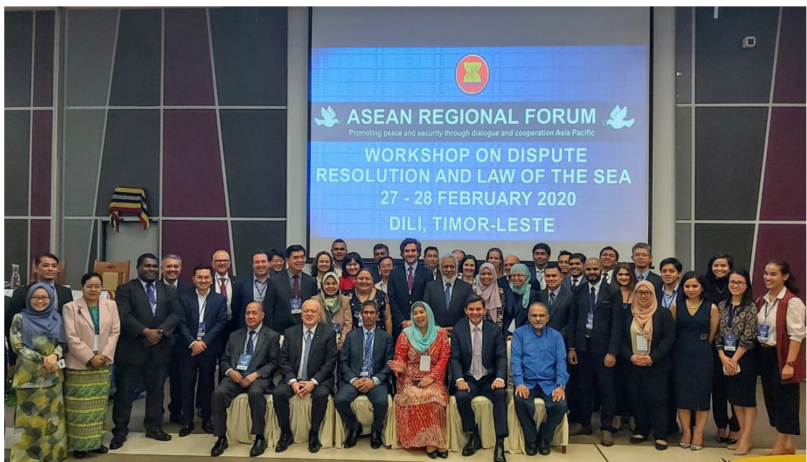
ARF speakers, panelists and participants, Ministry of Finance, Dili, 27 February 2020