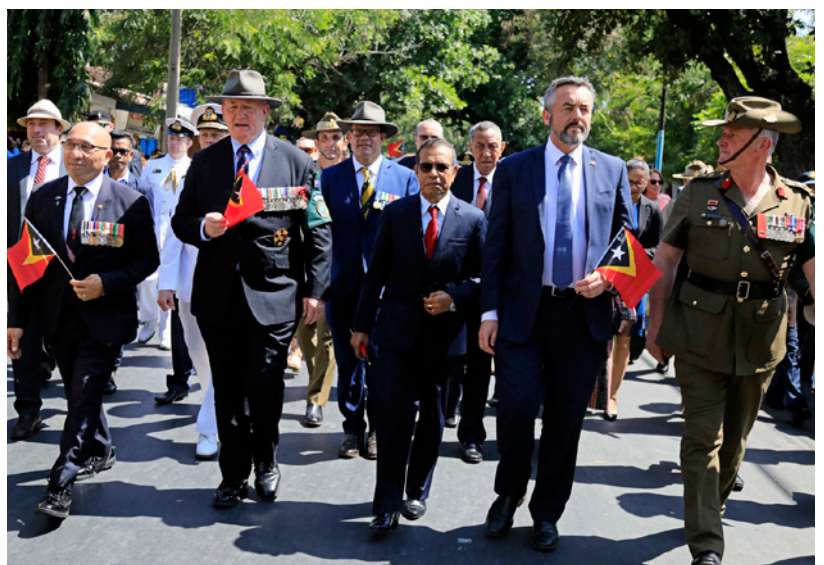
March in memory of the INTERFET, 20 September 2019

Sir Cosgrove led the March with the original 1999 INTERFET flag, and accompanied by more than 250 veterans from FALINTIL and INTERFET. The veterans and other dignitaries were invited to participate in a friendship lunch at the Dili Convention Centre, chaired by H.E. Dr. José Ramos-Horta, former President of the Democratic Republic of Timor-Leste.