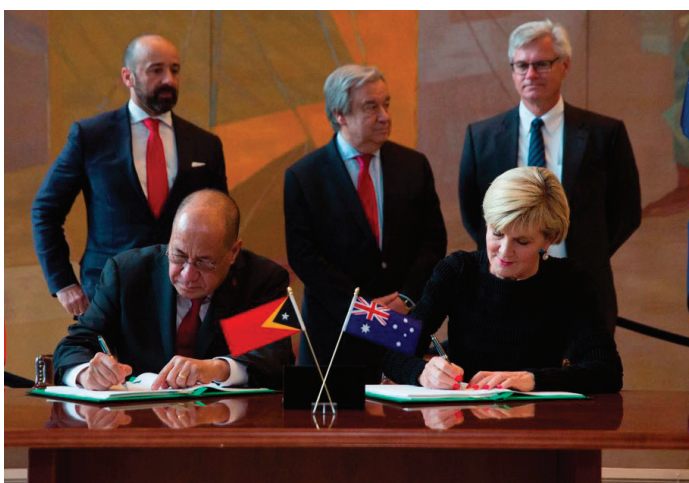
The Agent for Timor-Leste in the Conciliation Agio Pereira and the Australian Foreign Minister Julie Bishop sign the Maritime Boundary Treaty at the United Nations Headquarters, New York, on 6 March 2018, in the presence of the UN Secretary-General and the Chair of the Conciliation Commission

The Timor-Leste Government initiated compulsory conciliation under the United Nations Convention on the Law of the Sea in April 2016. After a long-running dispute, Timor-Leste triggered this process to bring Australia to the negotiating table so that it could pursue its sovereign rights and secure permanent maritime boundaries in the Timor Sea. In taking this step, Timor-Leste became the first country to use this mechanism under the Convention.